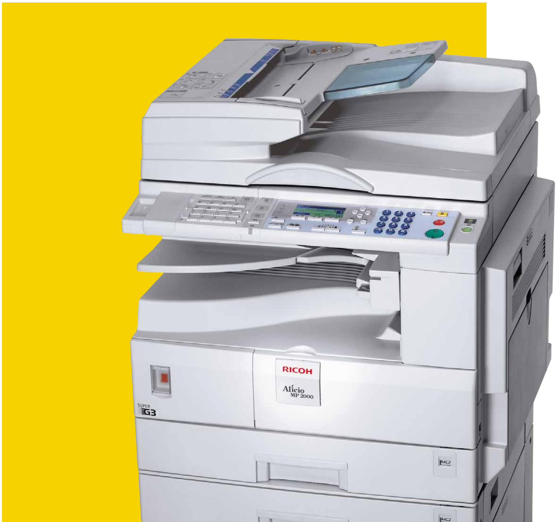
Aficio™ MP 1600/MP 2000